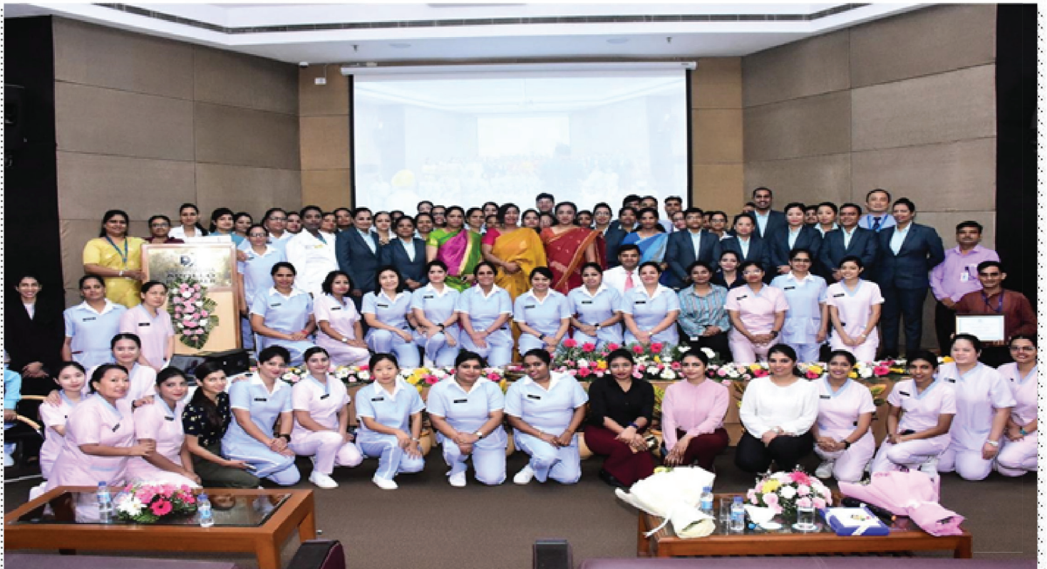
Nursing Team with Group Director Nursing