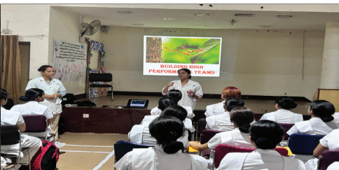
SESSION ON TEAM BUILDING