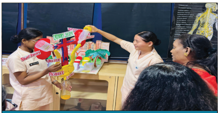
SNA MODEL MAKING COMPETITION