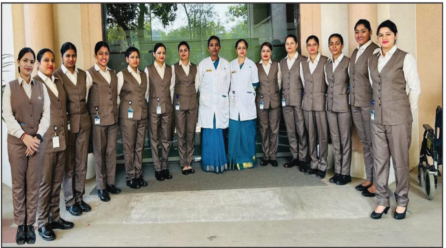
Faculty of School of Nursing