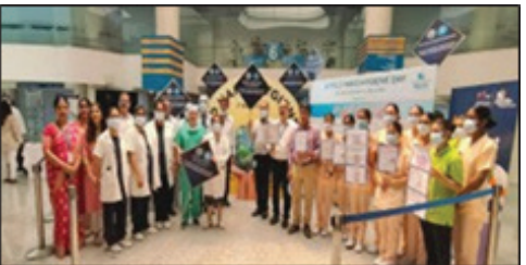
WORLD HEALTH HYGIENE DAY PROGRAM